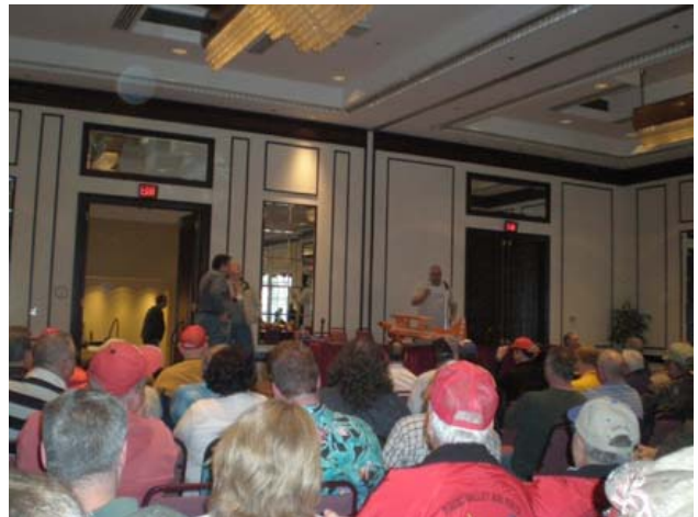
Looks like the Toledo auction is in progress.