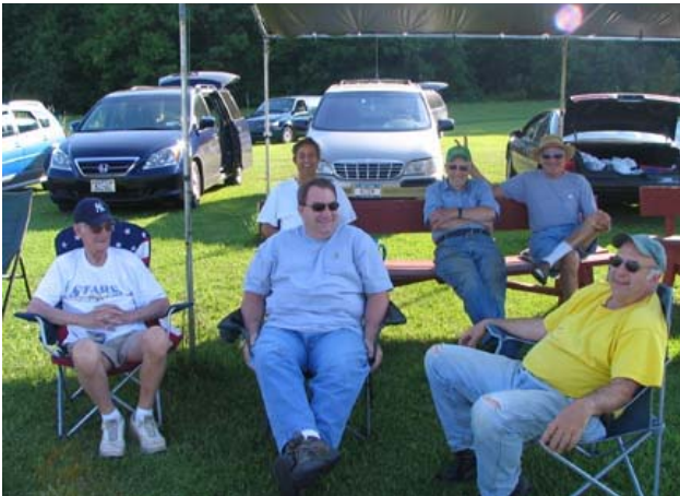
The motley crew on a Thursday Evening.