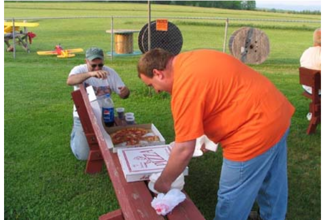
The pizza king caught with his hand in the cookie jar.