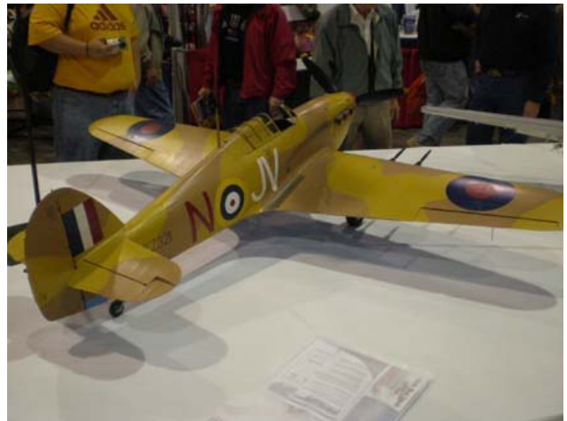
A new color scheme for Max's Hurricane.