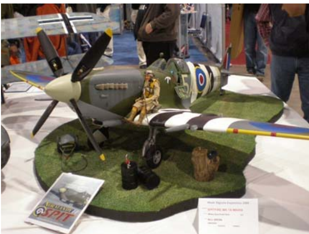
Now this is really class !!.