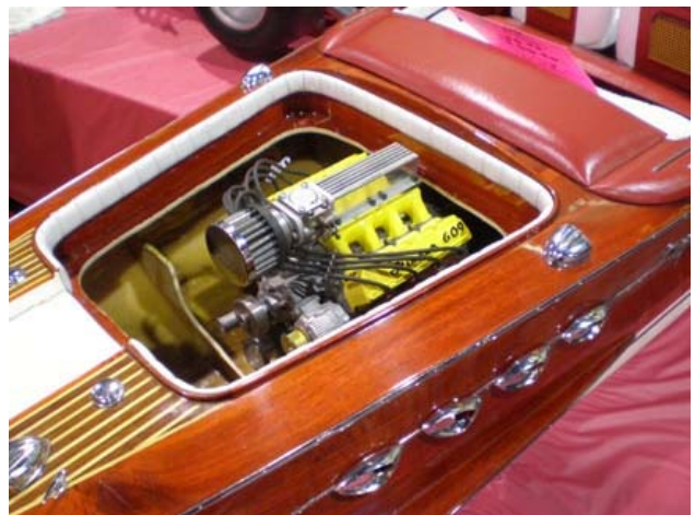
Great shot of an RC boat engine installation.