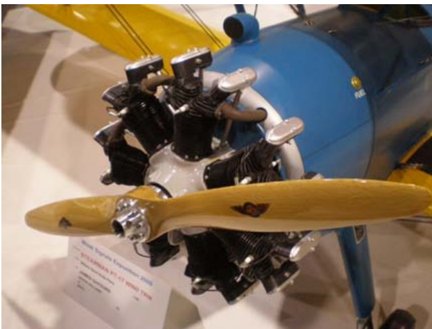
How about that for a radial. You can't tell if it is the real thing or not..