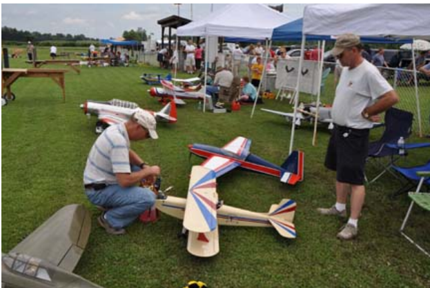
The gruesome twosome getting Max's plane ready for a flight.