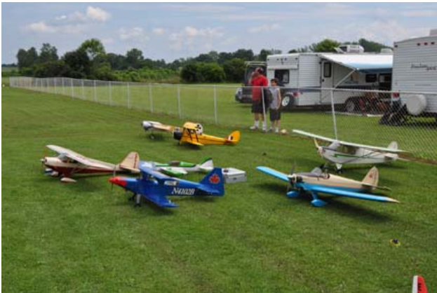
A nice display of planes at the Sky Rovers.