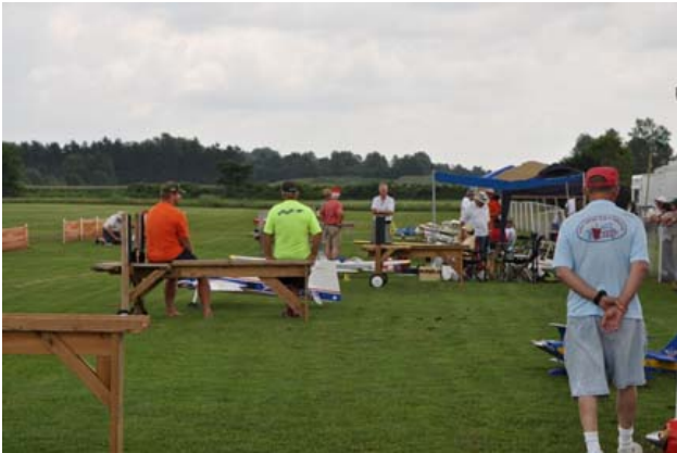
The Sky Rovers fun fly in July.